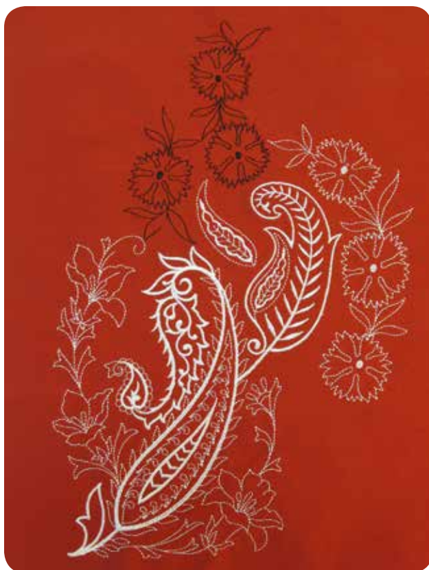
Design 4 is the final design.